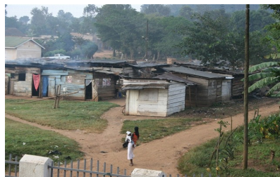
The view from our accommodation, the Palms Springs hotel in Masaka

$5 per fortnight is enough to give a primary school kid an education. It pays for their school fees, lunch at school, and a new uniform.