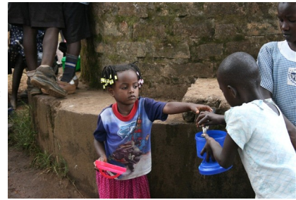
Kids getting "free" water from the one school tank which is unlocked at lunch time.

100 three seater wooden desks were made by the skilled local carpenter Augustine who told us that it was the biggest contract he had ever had. He had to put on two staff to meet the deadlines that we had set. As a result 300 less children are sitting on the floor in class.