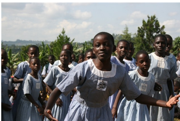
A welcoming dance at St Joseph's

This is a phrase that you will hear many times each day from people you meet in Uganda.