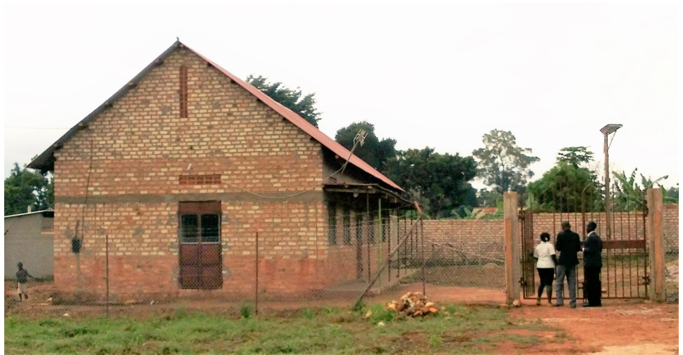
St Bruno's Secondary Girls Dormitory

While visiting St Bruno's Secondary we were very excited to see an almost completed new building. Madam Justine explained that many of the students had long walks to school each day ( 6—10 kilometres) and that some of the girls had been sexually assaulted on the way. The solution was to build a dormitory on land provided by the Parish. Now the girls can study and live in a secure location. Uganda Kids support was instrumental in assisting the school to build the dormitory. Thank You.